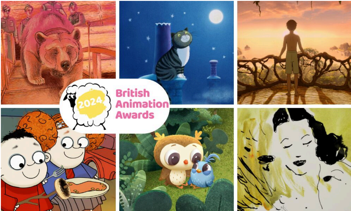
Britain's Best: BAA 2024 winners include (L-R, T-B) 'A Bear Called Wojtek,' 'Mog's Christmas,' 'Kensuke's Kingdom,' 'The Rubbish World of Dave Spud,' 'Odo' and 'The Debutante.'