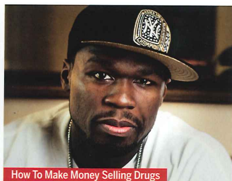
How To Make Money Selling Drugs

Showcase has boarded You May Not Kiss The Bride , which Freestyle Digital Media will dis-