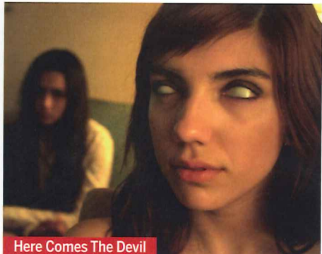
Here Comes The Devil