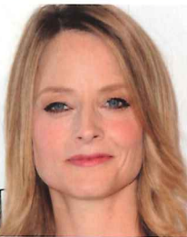
Above: Carey Mulligan; Jodie Foster